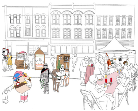
Downtown and Village Events