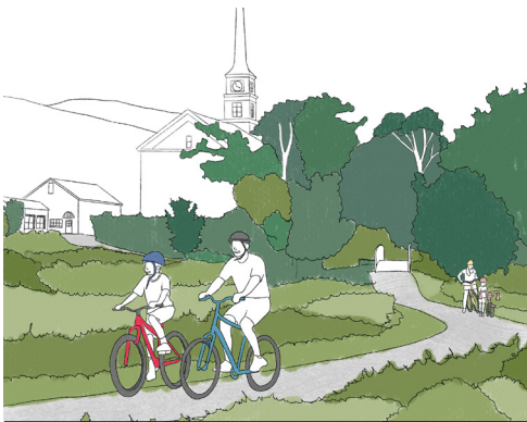
Walking and Biking Trails